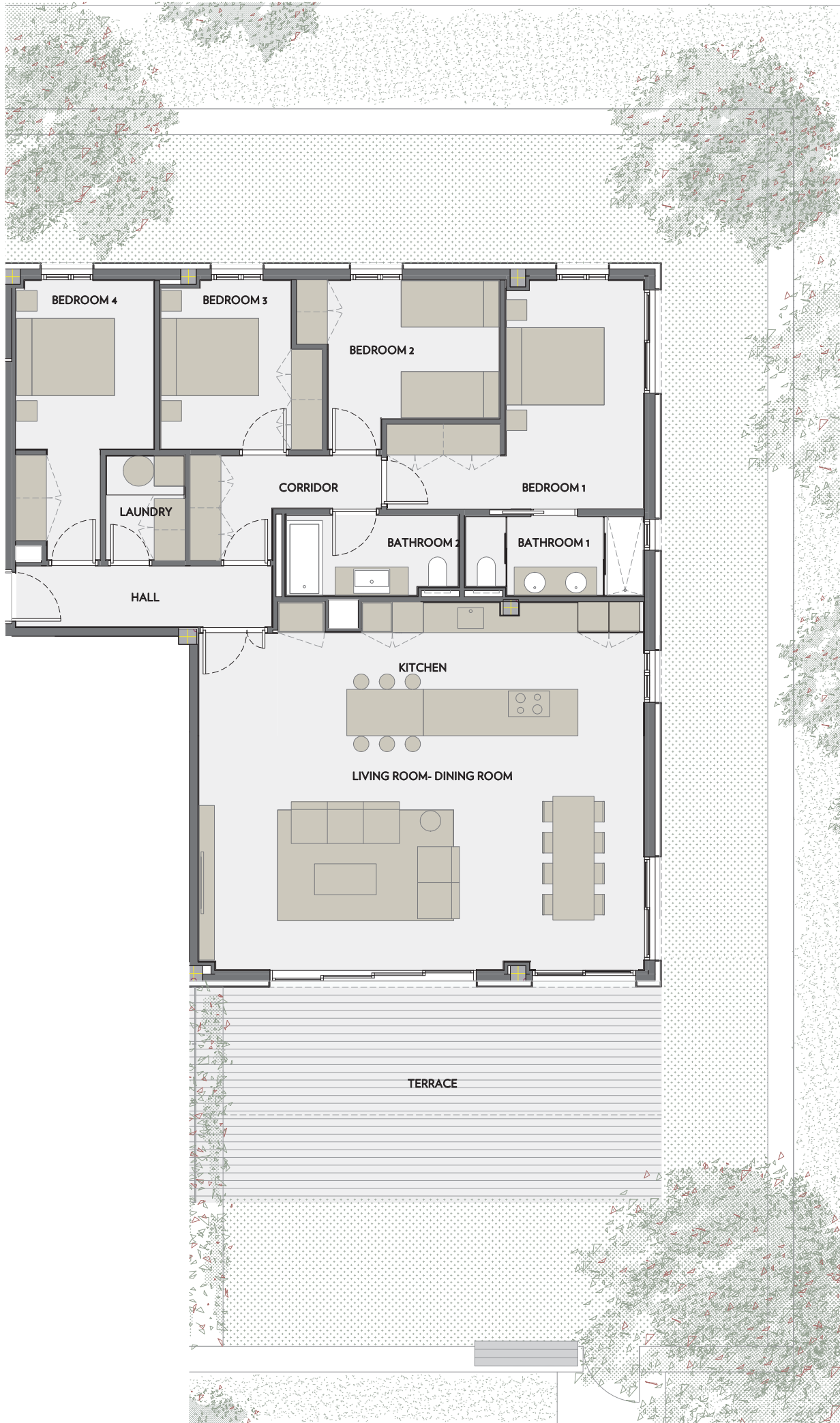
VIA MARIS. PLOT II OF THE RECREATIONAL AND TOURIST CENTER OF VILA-SECA AND SALOU